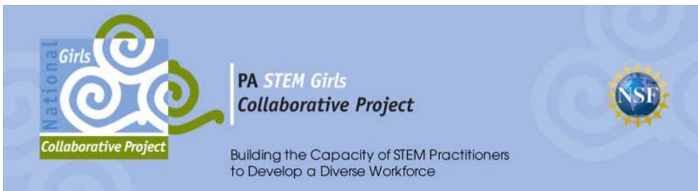
Host: PA STEM Girls Collaborative Project

eCenter Wins SV Chamber 2012 Phoenix Award for Innovation