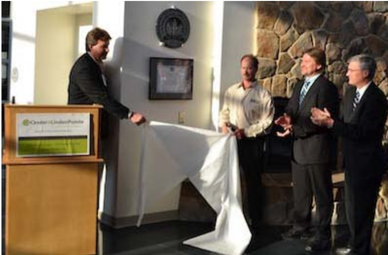
Silver LEED Celebration Ceremony