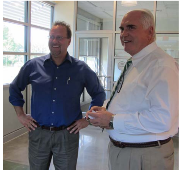
Visit from Congressman Mike Kelly